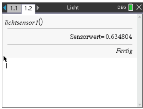
Figure 3: Program code