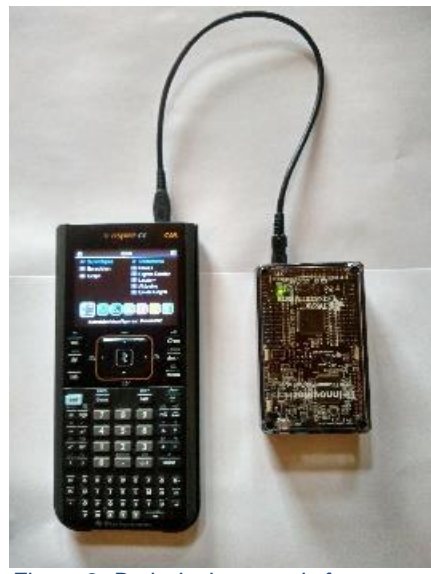
Figure 2: Both devices ready for use

The TI-Innovator Hub has a light sensor. It is now necessary to learn more about this sensor together with the computer so that the various light sources can be examined. Connect the calculator to the hub with the included cable. The side with the printed A connects to the calculator. Switch on the calculator and after a short time a green LED on the hub will light up. Then everything is ok. You are ready to start.