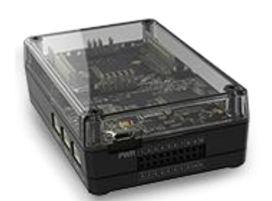
Figure 1: TI-Innovator Hub https://education.ti.com/de/products/micro-controller/tiinnovator

The TI-Innovator Hub has a light sensor. It is now necessary to learn more about this sensor together with the computer so that the various light sources can be examined. Connect the calculator to the hub with the included cable. The side with the printed A connects to the calculator. Switch on the calculator and after a short time a green LED on the hub will light up. Then everything is ok. You are ready to start.